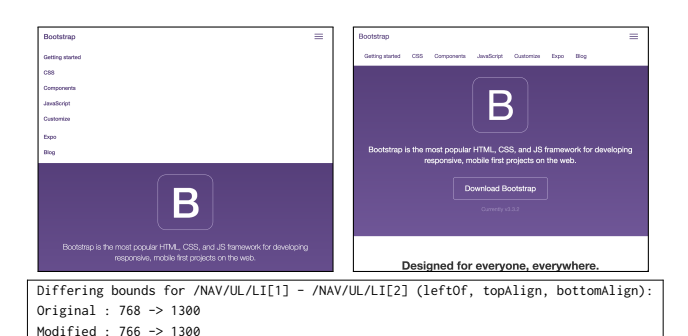
Figure 3: The original version of getbootstrap.com (top-left), the incrementally modified version (top-right), and a snippet of the report produced by REDECHECK (bottom).

To investigate the prevalence of the five common types of RLFs in real-world web pages and evaluate REDECHECK's ability to detect them, we ran the tool on a corpus of 26 randomly collected web pages of varying complexity and domain. REDECHECK found RLFs of all five common types. Well over half of the web pages, including well-known ones such as Duolingo and Consumer Reports , contained RLFs [18]. Since these pages were all in production use and, we surmise, already subject to extensive testing, this result emphasises the importance and real-world relevance of the presented tool, further underscoring the benefits of using REDECHECK's automated layout checkers. This empirical study also revealed that REDECHECK outperformed several spotchecking approaches. For instance, a manual spotcheck missed Duolingo 's layout failure, as highlighted in Figure 1, illustrating the error-prone nature of current industrial quality assurance practices for responsive pages.